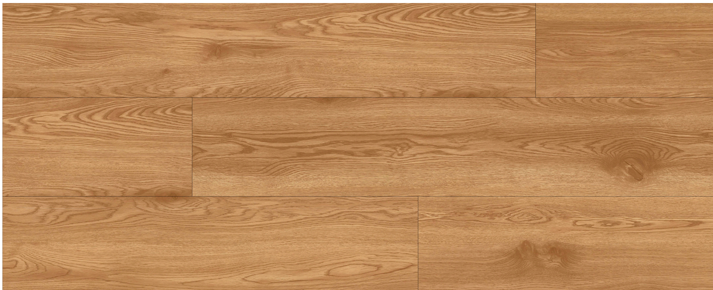
NATURAL WOOD #1700